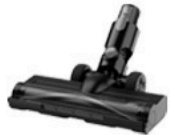
LED ROLLER BRUSH