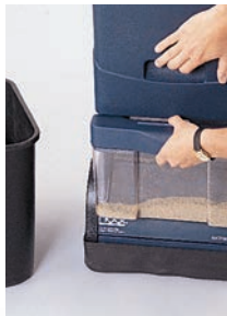
Clear, bagless hopper for quick and easy dumping