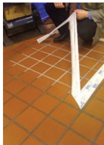
Use HOST Dry Extraction Cleaner with the Liberator to clean grouted and textured hard floors.