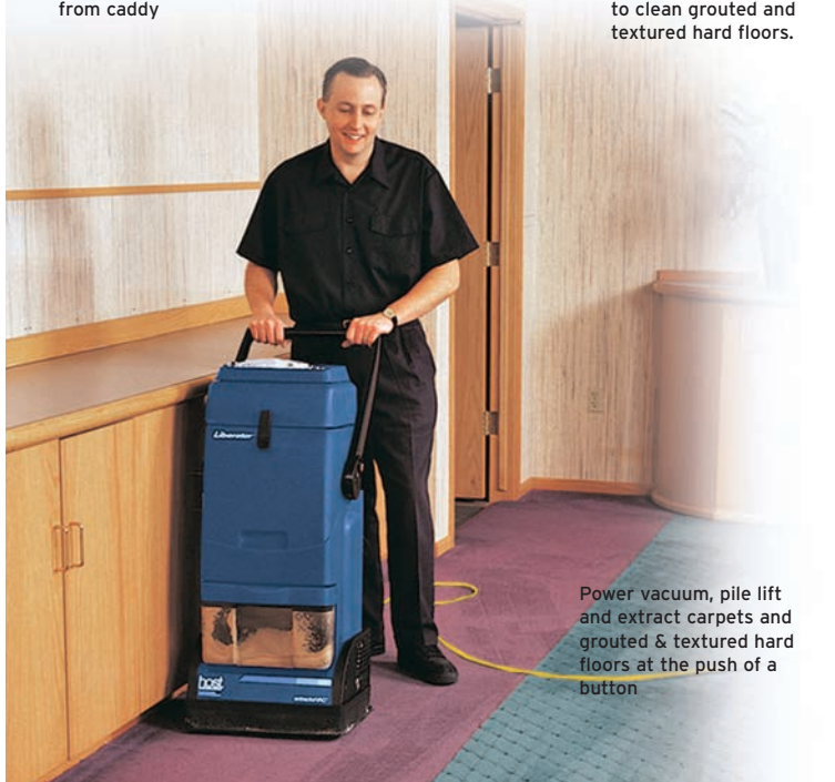
Power vacuum, pile lift and extract carpets and grouted & textured hard floors at the push of a button