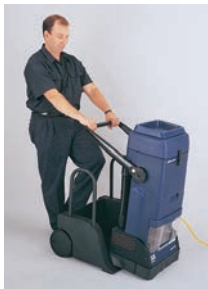
Brush drive makes it easy to load and unload from caddy