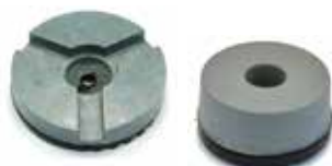
PAVELUX SERIES for removing mastic and grinding abrasive marbles or granites.