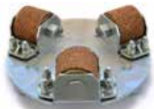
SANDBLASTING for Blasting Effect.