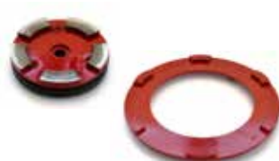
CS SERIES for polished Superconcrete® process.