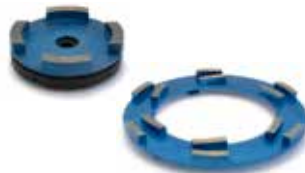
TCK DA00 SERIES levelling, coating removal on concrete.