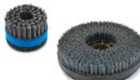
ANTIKE BRUSH SERIES to produce an antique look on stone floors.