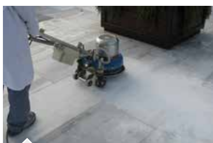
Levighetor 600 with bush hammer tool