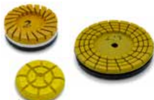
YELLOW SERIES for polishing marble.