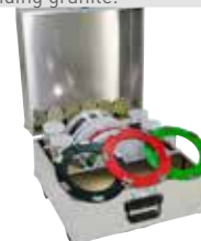
EASY KIT Complete Kit for Grinding and Polishing.