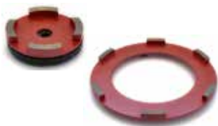
CD SERIES for medium hard concrete.