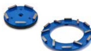
CF SERIES for asphalt and very abrasive concrete.