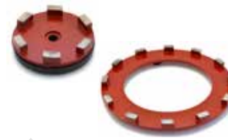
GS SERIES for grinding granite.