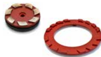
MS SERIES for grinding marble floors.