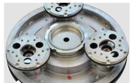
k1200 planetary head included