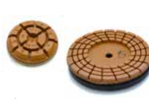
ORANGE SERIES for polishing terrazzo, limestone and abrasive marble floors.