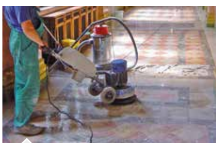
Suitable for any surfaces