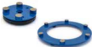
BT SERIES for effective grinding and removing resin, glue and varnish.