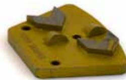
PDC SUPER SKRAPER to remove thick rubbery material and coating on floor.