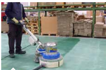
Suitable for any surfaces