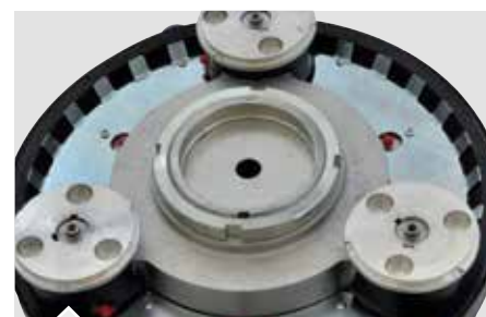
k1000 planetary head included