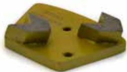
BT00 ARROW thin resin/paint removal on hard concrete.