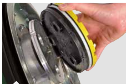
Quick Attack system