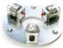
BUSH HAMMER special tool for many applications.