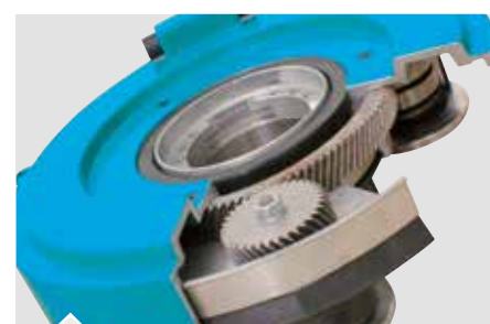
Full metal gear box