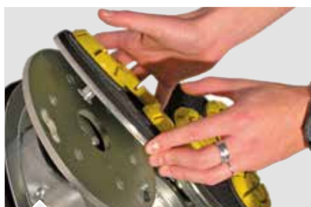
Quick Attack system