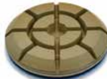
JUMPER GREEN SERIES for polished concrete.