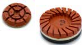
RED SERIES for polishing granite.