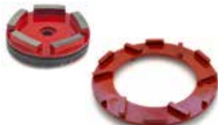
CA SERIES for abrasive concrete.