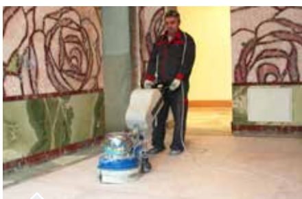
Suitable for any surfaces