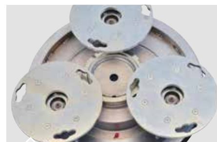
k1500 planetary head included