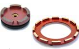
MTS SERIES for grinding travertine, terrazzo, limestone, agglomerate and abrasive marbles.