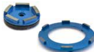
DA SERIES for medium abrasive concrete.