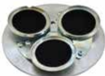
SPRING HOLD SYSTEM device for grinding and polishing concrete floors.