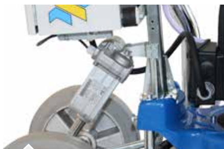
Adjustable working pressure