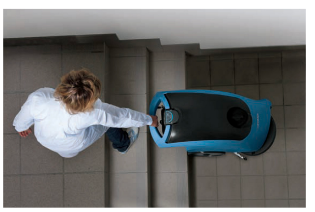
Get over stairs easily with large diameter wheels