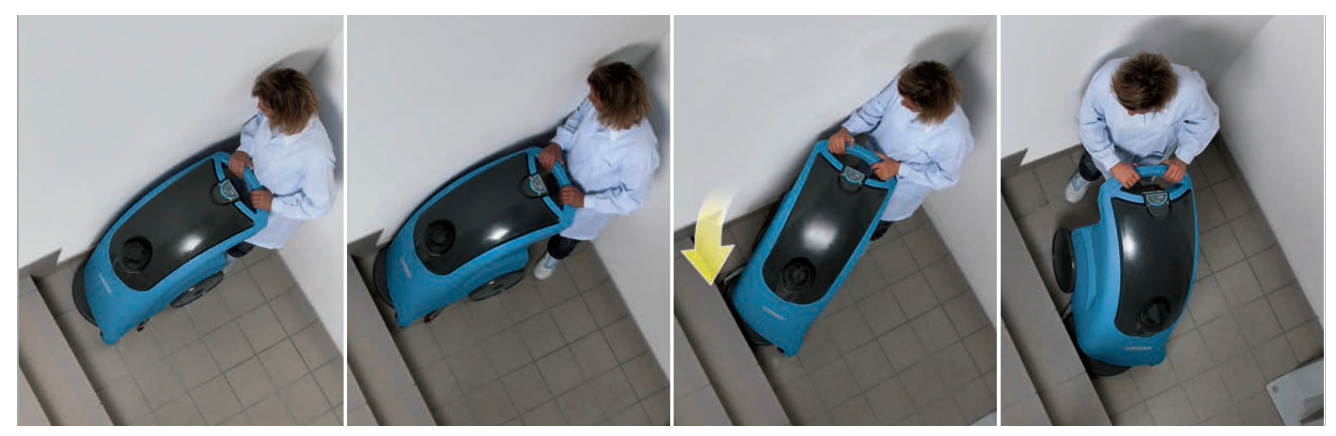
With its large diameter wheels, My16 makes it easy to move around and ensures easy transportability.